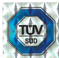
Head of the certification body